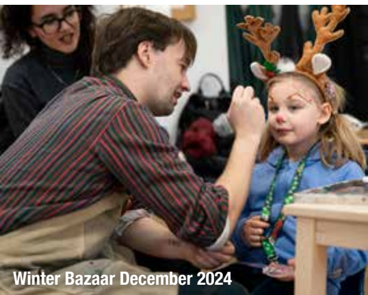
Winter Bazaar December 2024

Through these efforts, we seek to cultivate a generation of compassionate leaders who are attuned to the social and environmental challenges of our time. By fostering social awareness, empathy, and a deep sense of purpose, the Oak & Elm Foundation empowers young people to leave a lasting, positive mark on their communities and beyond.