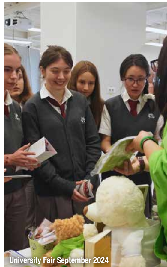
University Fair September 2024

Year 12 students run interventions with Year 5 students several times a week before school. Student volunteers work with Primary leadership on content and delivery. So far, volunteers have read books and worked on plays with their tutees.