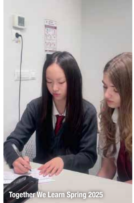
Together We Learn Spring 2025

This project is led by another of our Year 12 IB students in partnership with EduAct. Following the success of our work with the Dorobantu Primary School, she has organised an online tutoring programme which pairs Dorobantu Primary students with eighteen Year 10 CSB students. Every Friday after school, CSB students meet with their partners to practise maths and Romanian for an hour. Students on both sides of this programme have greatly profited from the experience.